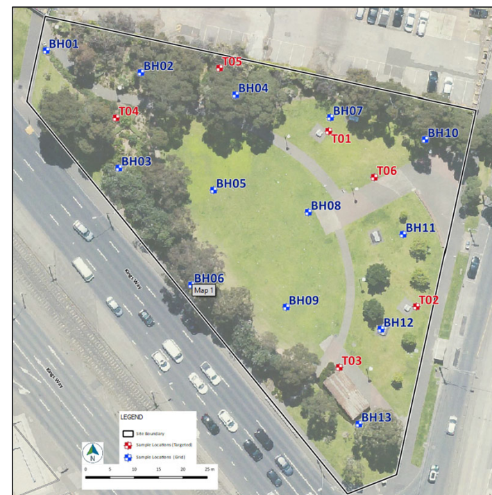
DSI: 6 Targeted Locations 13 Grid Based Locations