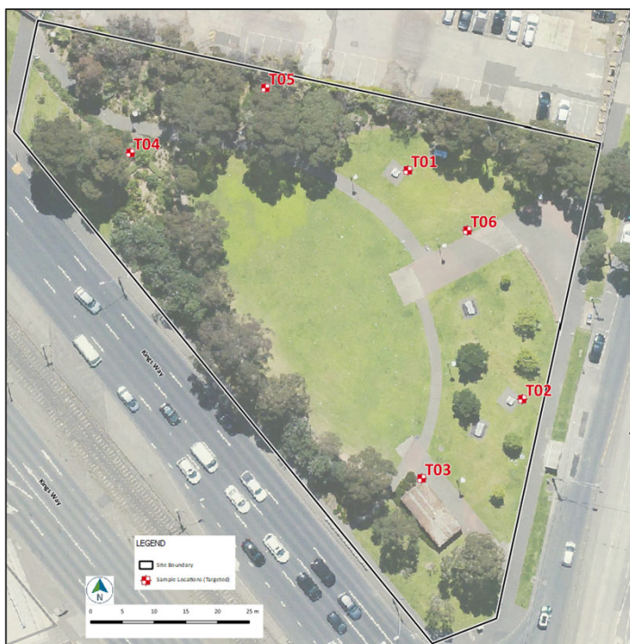
PSI: 6 Targeted Locations